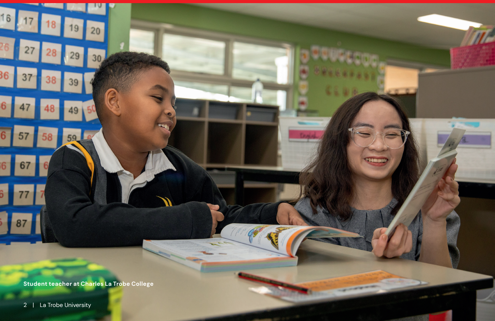
Student teacher at Charles La Trobe College

La Trobe University is pleased to submit these policy priorities, and we look forward to working collaboratively with the next Commonwealth Government.