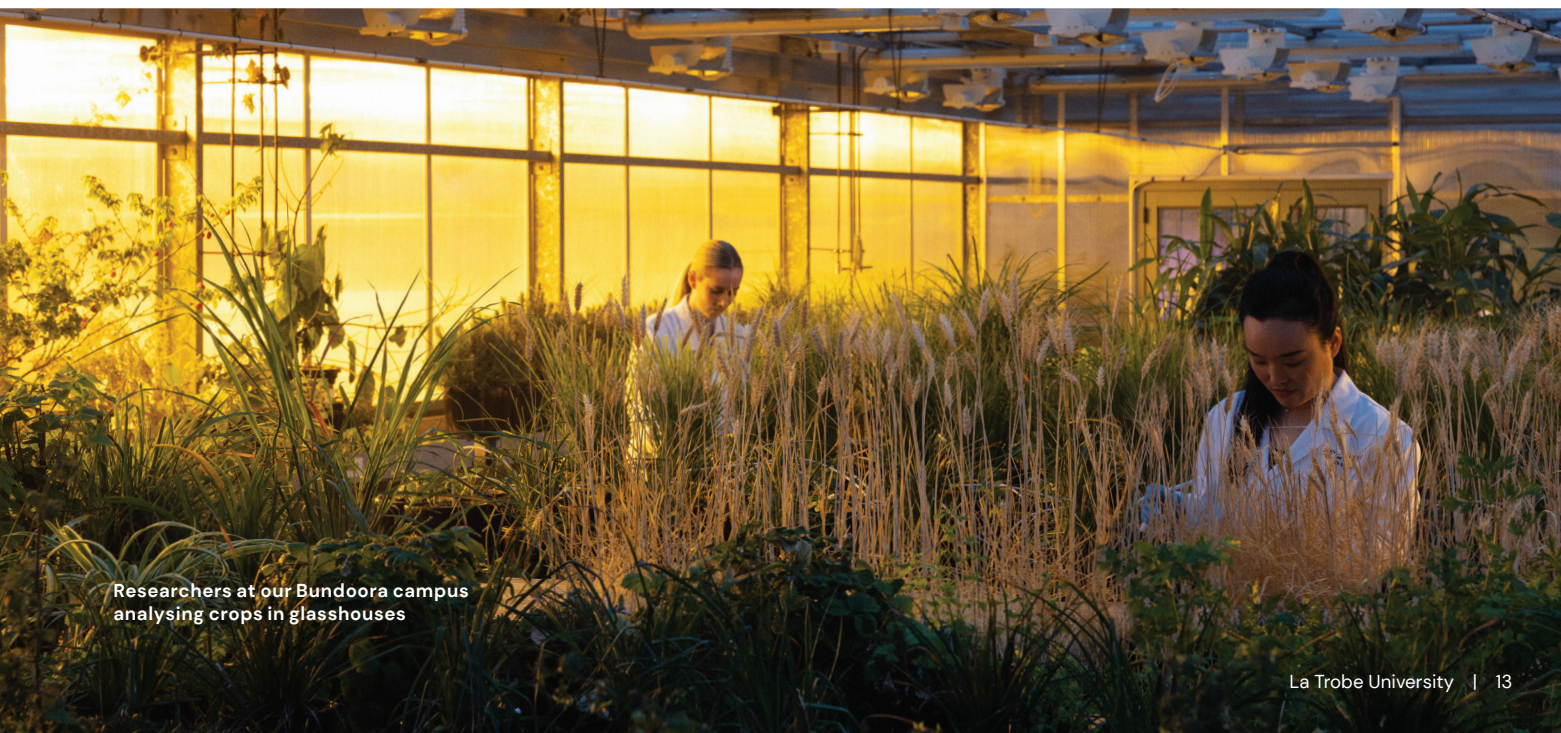
Researchers at our Bundoora campus analysing crops in glasshouses

Ask of Commonwealth: La Trobe is seeking $20 million investment in infrastructure and capital works to support stage one works. This will see investment in fit for purpose industry spaces and equipment to support industry to enable the production and manufacture of new foods that are safe, nutritious, and appealing to the consumer while meeting industry standards. La Trobe will invest a combined $10 million in cash and in-kind to realise AFINA.