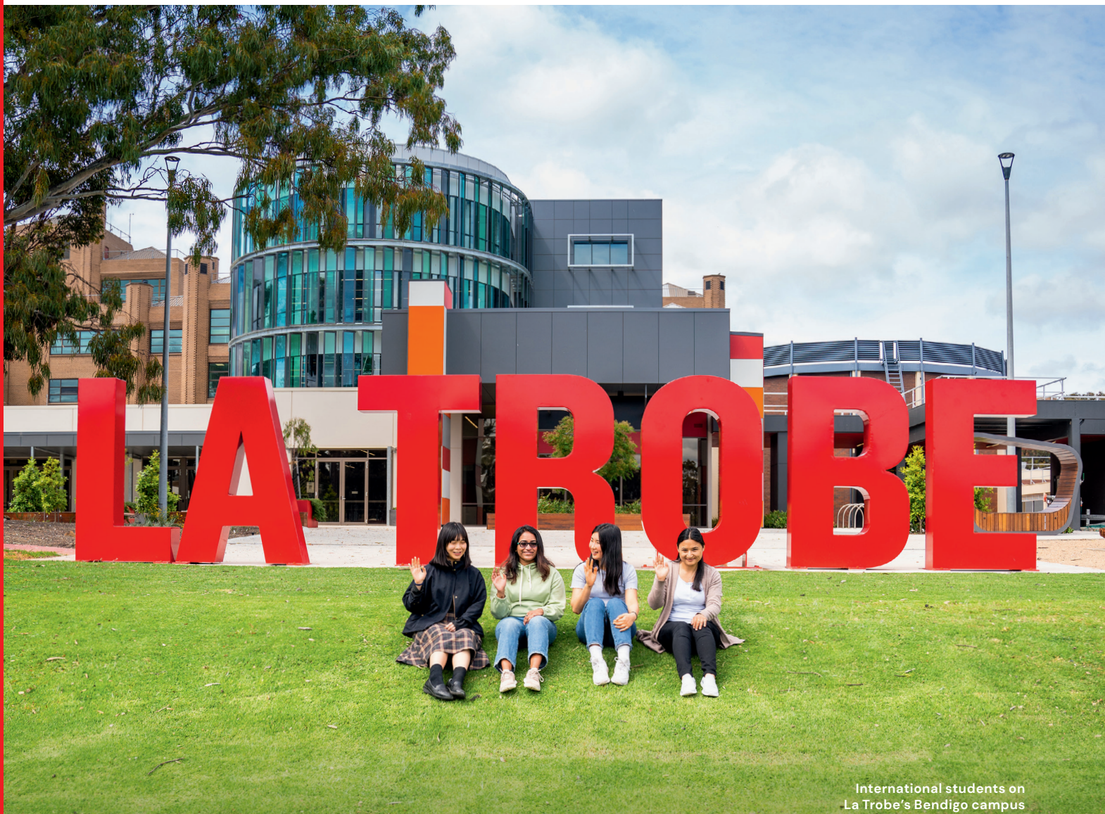
International students on La Trobe's Bendigo campus

Ask of Commonwealth: La Trobe seeks $2 million to support planning for the establishment of a Digital Innovation Hub in Bendigo and identify secondary locations across the region. A further request to fully operationalise the proposal would follow the completion of this work.