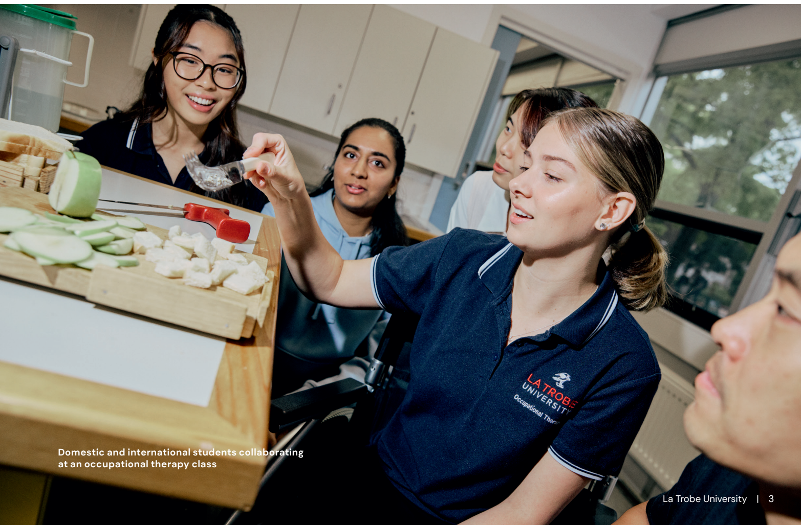
Domestic and international students collaborating at an occupational therapy class

Ask of Commonwealth: La Trobe calls for the immediate removal of Ministerial Direction 107 and its replacement by a transparent and fair policy lever to manage international education settings that provides certainty to the sector while upholding integrity in the system.