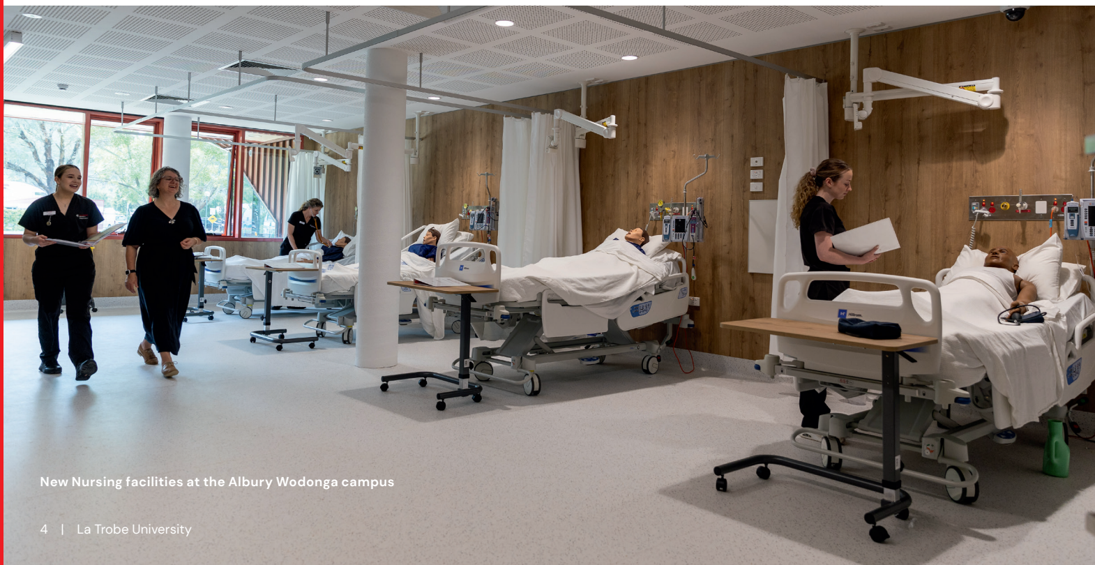
New Nursing facilities at the Albury Wodonga campus

Ask of Commonwealth: La Trobe requests an additional 3,000 Commonwealth Supported Places by 2028. These additional CSPs would be part of a larger, national pool that would be available for institutions like La Trobe with plans to address Australia's workforce shortages.