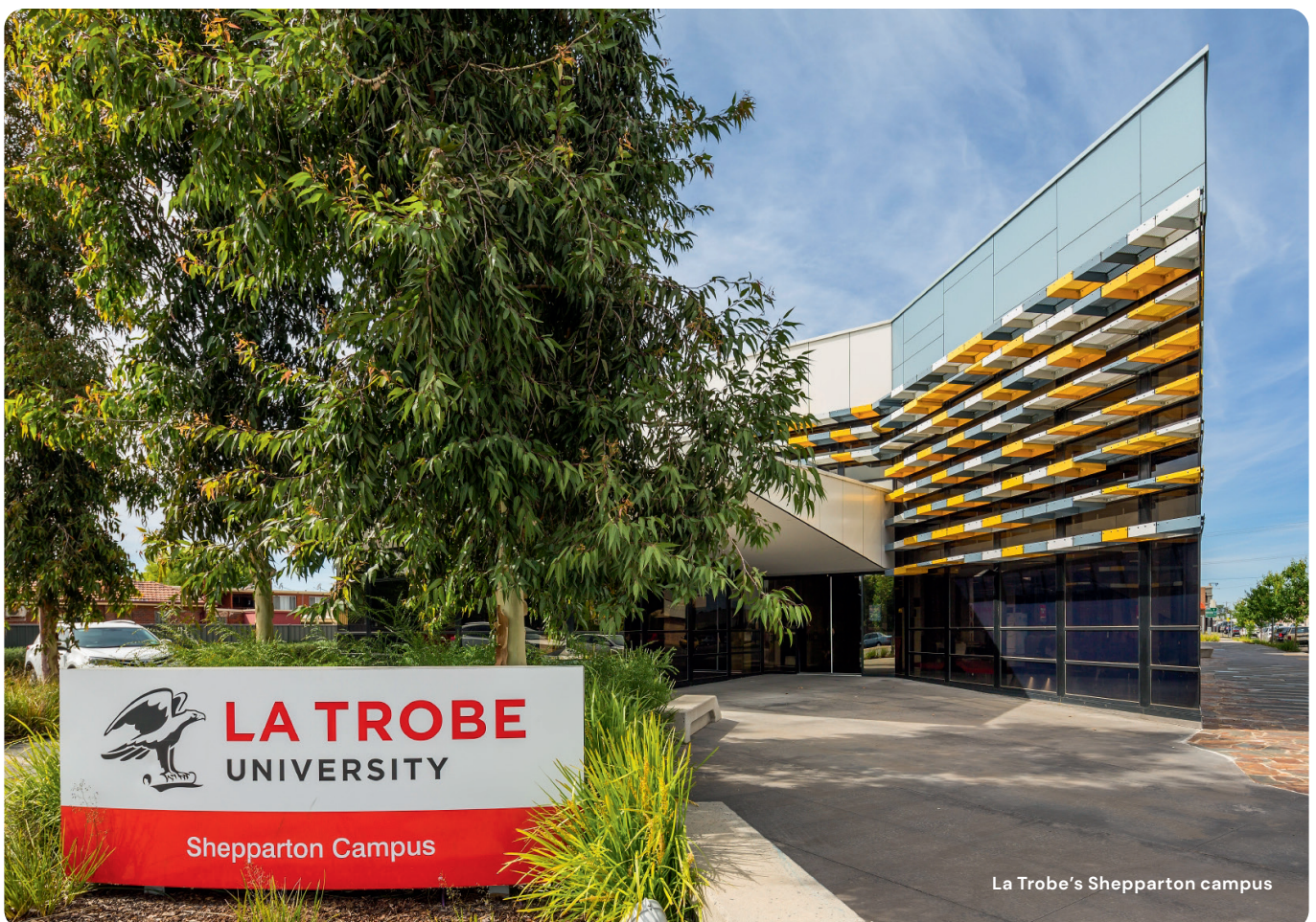
La Trobe’s Shepparton campus

Ask of Commonwealth: La Trobe seeks $900,000 to create a finalised precinct plan for the Shepparton region, including specifications for buildings, facilities, and programs that embed the needs of stakeholders across the community.