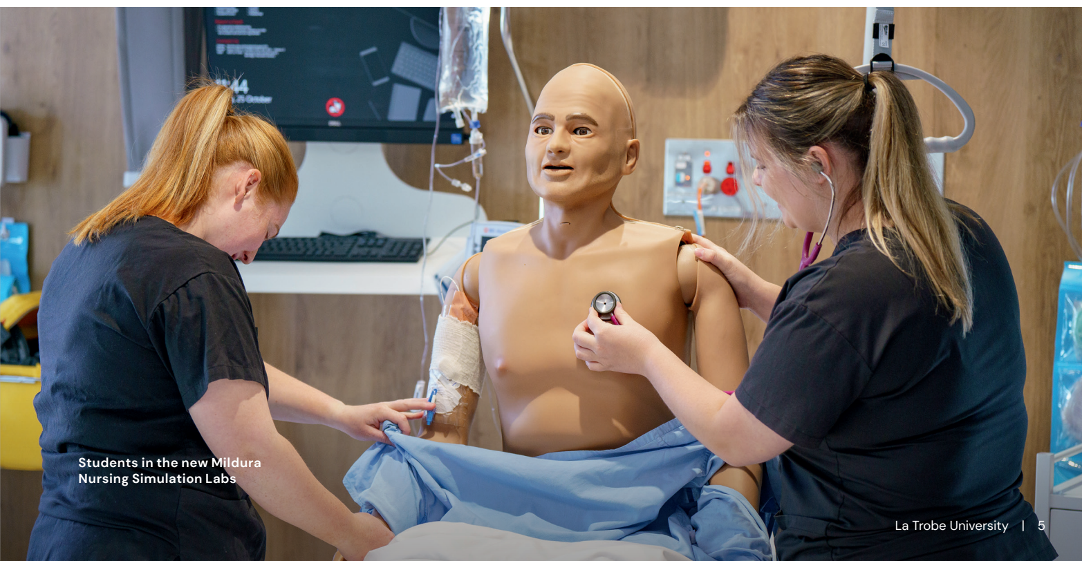
Students in the new Mildura Nursing Simulation Labs

Ask of Commonwealth: We know that a key to completing studies is financial security. La Trobe calls on the next Commonwealth Government to expand the Commonwealth Prac Payment to students studying Allied Health programs who also need to undertake mandatory practicum placements.